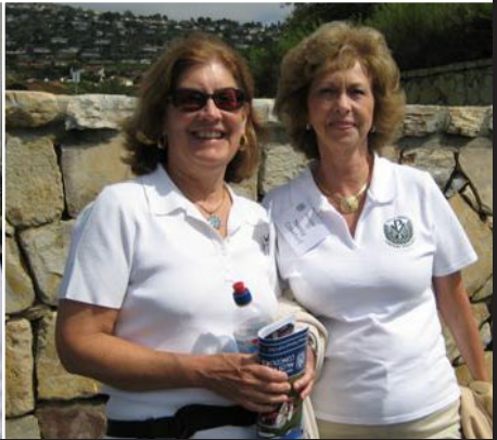
Apologies for not being able to picture all the wonderful Rotarians and Rotary family members who made the 2008 PV Concours a success.